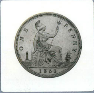
Victorian bronze penny