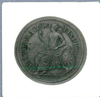
Pattern halfpenny of Charles II