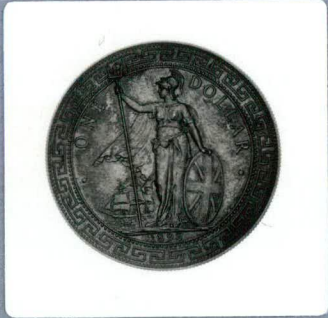
British Trade Dollar, 1895