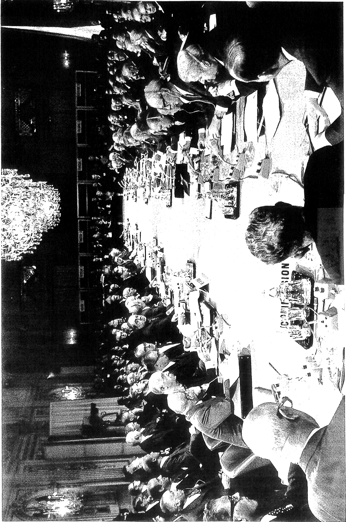
Summit conference. General view.