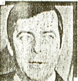
Andrew L. Lewis Jr., 49 Transportation Secretary Trustee for the bankrupt Reading Railroad... deputy chairman of Reagan-Bush Committee and Republican National Committee... ran Pennsylvania campaigns for Gerald Ford in 1976 and Mr. Reagan this year.