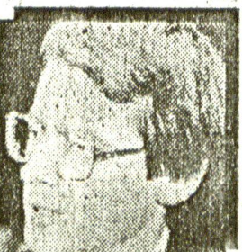
David A. Stockman, 34 Budget Director Staff aide to John B. Anderson in 1979... executive director of the House Republican Conference in 1972... elected to House in 1976... member of Interstate and Foreign Commerce Committee.