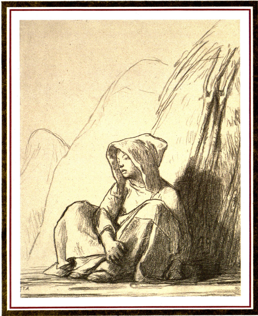
Jean-François Millet (1814-1875)