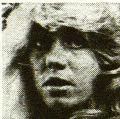
The lovely bride