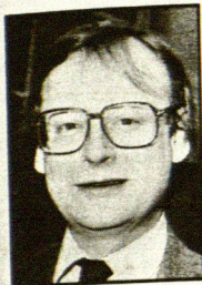
Mr John Gummer

Mr John Gummer became Minister of State for Agriculture, Fisheries and Food in 1985; Paymaster General, 1984-85; Minister of State for Employment, 1983-84, being chairman of Conservative Party, 1983-85; Under Secretary of State for Employment, Jan-Oct 1983. Elected for this seat 1983; MP for Eye, 1979-83, and for Lewisham West, 1970-Feb 1974; contested Greenwich, 1964 and 1966. Lord Commissioner of the Treasury (Govt whip), 1981-83; asst Govt whip, 1981. Mbr, General Synod, C of E, since 1979. B Nov 26 1939; ed King's Sch, Rochester; Selwyn Coll, Cambridge (Pres of Union, 1962). Chmn, Fed of Cons Students, 1961. Mbr, ILEA, 1967-70. A vice-chmn, Cons Pty, 1972-74. PPS to Mr James Prior, Minister of Agriculture, 1971, and to Secretary of State for Social Services, 1979-81. Publisher, writer and broadcaster; chmn, Selwyn Shandwick International, 1976-81; Siemssen Hunter, 1979-80, and a director, 1973-80.