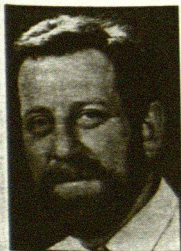
Mr Robert Clay

Mr Robert Clay, a bus driver with Tyne and Wear Passenger Transport Executive, 1975-83, was elected in 1983. Secretary, Campaign Gp of Lab MPs. B Oct 2 1946; ed Bradford Sch; Gonville and Caius Coll, Cambridge. Was sec, Sunderland and District Lab Pty. Branch chmn, GMB, 1977-83.