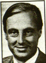
Mr Timothy Yeo

Mr Timothy Yeo was director of the Spastics Society, 1980-83, and on its exec cl, 1984-86; director, Worcester Engineering Co Ltd, 1975-86 (now consultant to Worcester Group plc). Elected in 1983; fought Bedwellty, Feb 1974. Mbr, Select Cmte on Social Services, since 1985. B March 20 1945; ed Charterhouse; Emmanuel Coll, Cambridge. Jt sec, Cons back-bench finance cmte, 1984-; Formerly taught agriculture in Tanzania. Treas, International Voluntary Service, 1975-78, now a vice-pres; trustee, Tanzania Development Trust, since 1980. Led campaign to save Tadworth Court Children's Hospital, Surrey; chmn, Tadworth Court Trust, since 1984. Mbr, Independent Development Cl on Mental Handicap. Chmn, Charities VAT Reform Gp, 1982-.