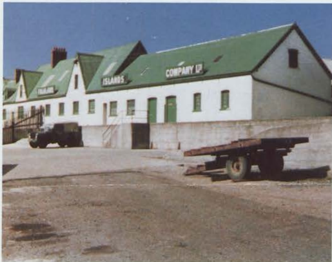
Photographs taken by the Chairman when visiting Port Stanley, including views of Company offices, the jetty, m.v. 'Monsunen', the 'Upland Goose Hotel' and the Colony Club.