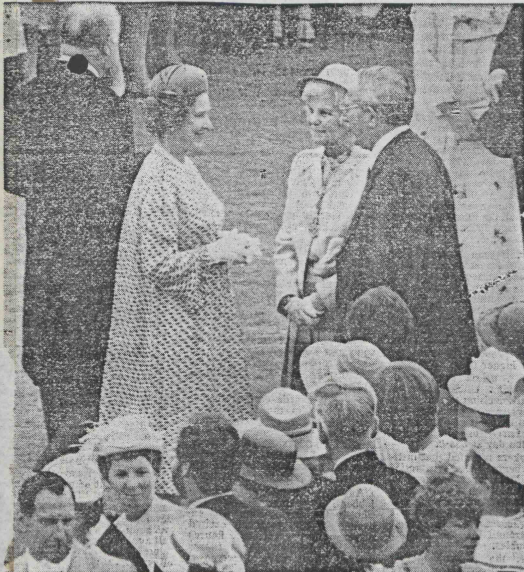
The Queen meeting guests at the Royal garden party in the grounds of Buckingham Palace yesterday.

One of the world's oldest active sailing vessels, the 132-year-old Baltic two-master Klaraborg, caught fire and sank off Western Australia yesterday. Three women and seven men on board were rescued.