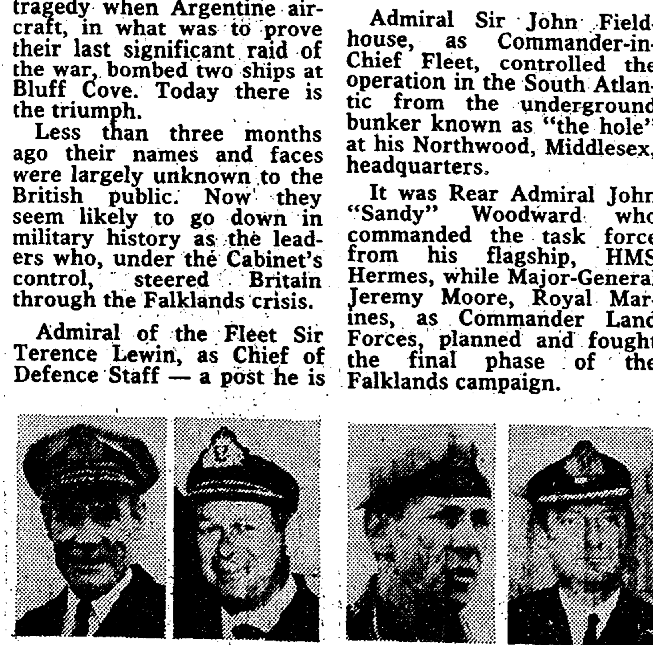
The men in charge: From left, Sir Terence Lewin, Admiral Sir John Fieldhouse, Major-General Jeremy Moore and Rear Admiral John "Sandy" Woodward.

due to relinquish this year — is Britain's senior Serviceman and coordinated the war effort, with advice from the Chiefs of Staff Committee — while he in turn advised Mr John Nott, the Defence Secretary. Admiral Sir John Fieldhouse, as Commander-in-Chief Fleet, controlled the operation in the South Atlantic from the underground bunker known as "the hole" at his Northwood, Middlesex, headquarters. It was Rear Admiral John "Sandy" Woodward who commanded the task force from his flagship, HMS Hermes, while Major-General Jeremy Moore, Royal Marines, as Commander Land Forces, planned and fought the final phase of the Falklands campaign.