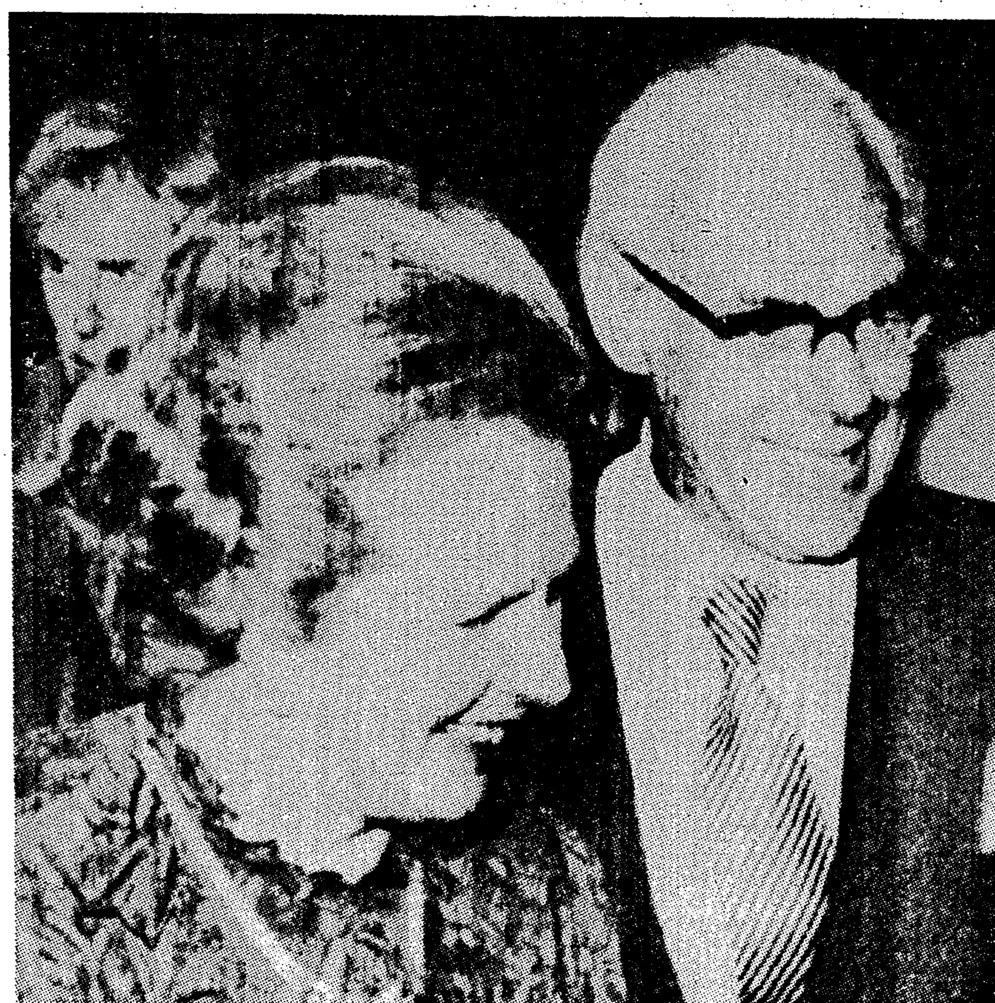
Triumphant return: Mrs Thatcher and her husband arriving back at Downing Street

No precise figures of the number of Argentines killed during the entire operation were available from the ministry last night, but the Argentine death rate has been far higher than the British. The figure given in Buenos Aires for those who died after the attack on the cruiser General Belgrano was 382, and 250 Argentine troops were killed in the British assault on Goose Green.