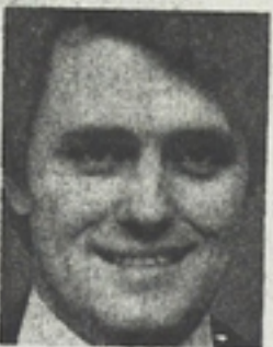
MALCOLM TURNBULL Maverick Australian lawyer representing Peter Wright in the spy book case in Sydney.