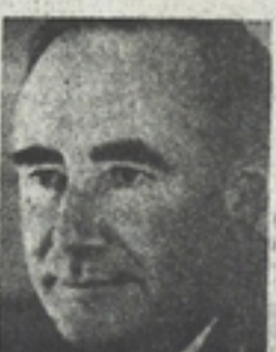
SIR ROGER HOLLIS A former head of MI5, who is now suspected of being a Soviet agent.