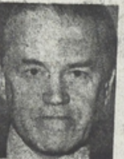
SIR ROBERT ARMSTRONG Cabinet Secretary who asked for two copies of the Pincher spy book for Mrs Thatcher.