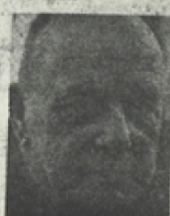
LORD ROTHSCHILD MI5 man suspected of spying who wanted Wright to help him clear his name.